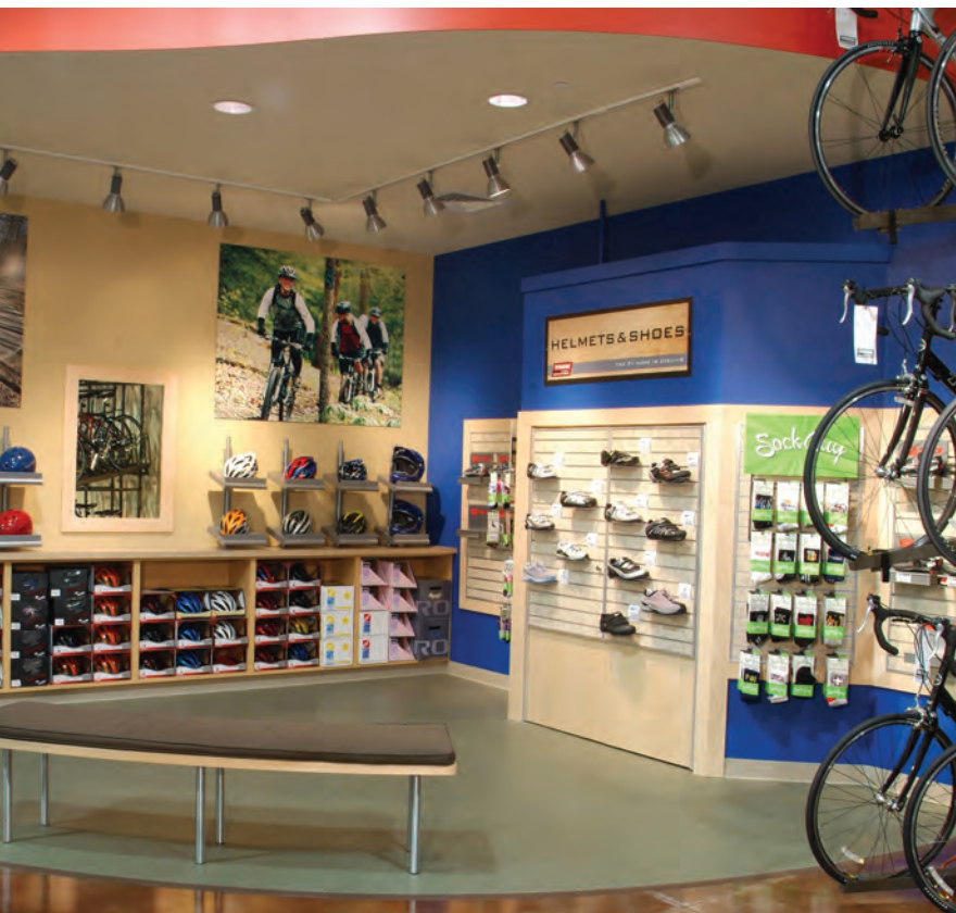
ECOstone, Trek Bicycle Store of Columbus, OH Architect: L.H. Cowan & Associates, Inc.

Plus, you'll groove on the fact that Cate Moss isn't just green in name only. Our environmentally-responsible manufacturing process helps you earn points for your project under the US/Canada LEED rating system and other global environmental initiatives.