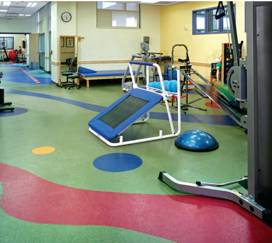
ECOearth, Dell Children's Medical Center, TX Architect: Karlsberger Platinum-level LEED-certified healthcare project